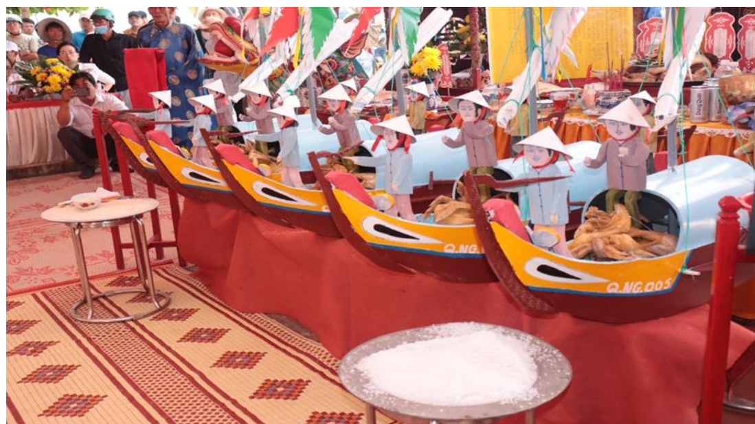
Figure 6. Model of the offering boat in the Khao le the linh ceremony at An Vinh communal house.