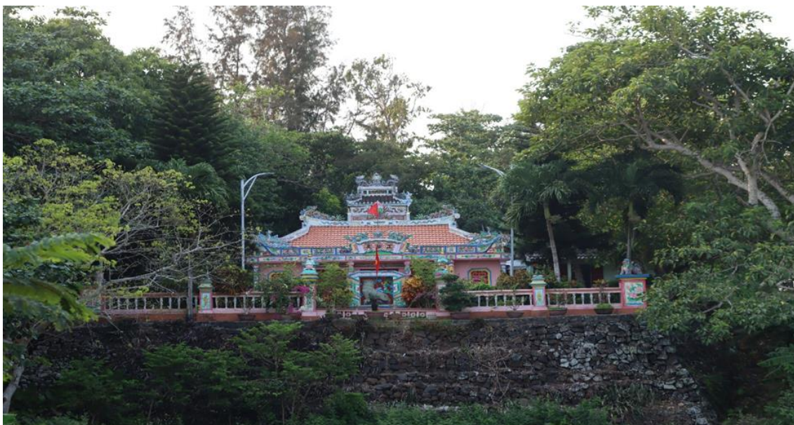
Figure 7. Dinh Thien Y A Na (Thien Y A Na temple) in A Hai village.

The people of Lý Sơn are proud of 24 shrines surrounding island dating back to late of 18th to early 19th century, such as An Vĩnh shrine, Vĩnh ân Buddhist temple, Âm hồn Buddhist temple, Tân Lập tomb all that dated to 1798; An Hải monument complex consists a shrine house, an ancestor shrine house, a shrine worshipping Bui Ta Han, shrine dedicated to the founder of village, shrine of whale, Thiên Quý shrine... All those structure were constructed over a previous monument foundation dated to 1820; in addition, there are many shrines dedicated to goddesses, whale, so on [10].