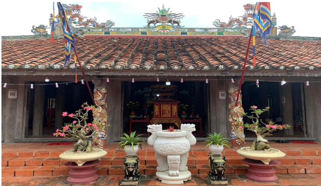
Figure 5. An Vinh communal house.