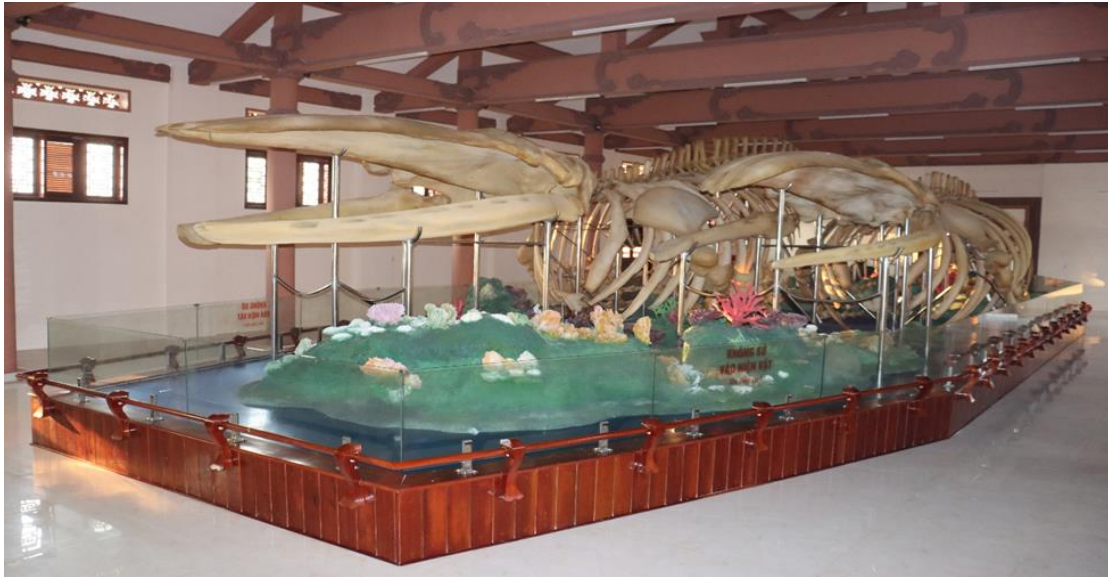
Figure 4. Whale skeleton worshiped at Lăng Tân Exhibition House.