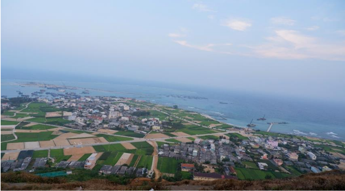
Figure 2. Ly Son landscape seen from Thoi Loi crater. Source: Nguyễn [8].