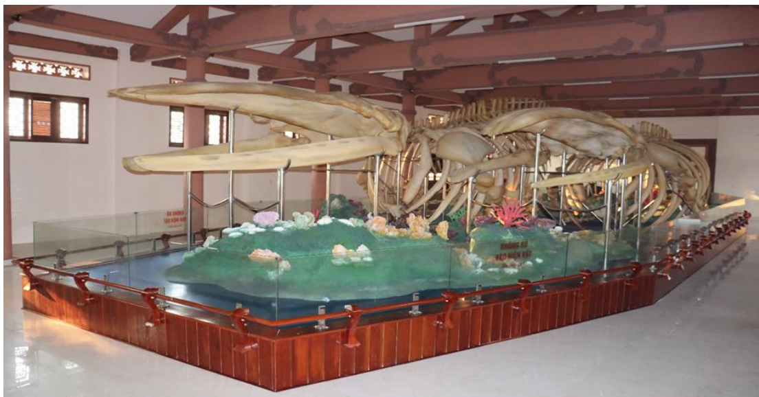
Figure 4. Whale skeleton worshiped at Lăng Tân Exhibition House.