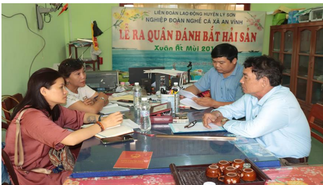
Figure 8. Interview with representative of Ly Son district Fishing Corporation.

The enduring presence of Lý Sơn fishermen in traditional fishing grounds serves as tangible evidence of their role in maintaining and protecting these maritime spaces. These activities have, in turn, shaped a unique cultural heritage system rooted in the natural environment. Festivals and rituals associated with the island's monuments have been transmitted across generations, preserving a rich heritage environment grounded in historical traditions and maritime culture. This intricate relationship between the community, their spiritual practices, and the sea highlights the resilience and cultural richness of the Lý Sơn islanders.