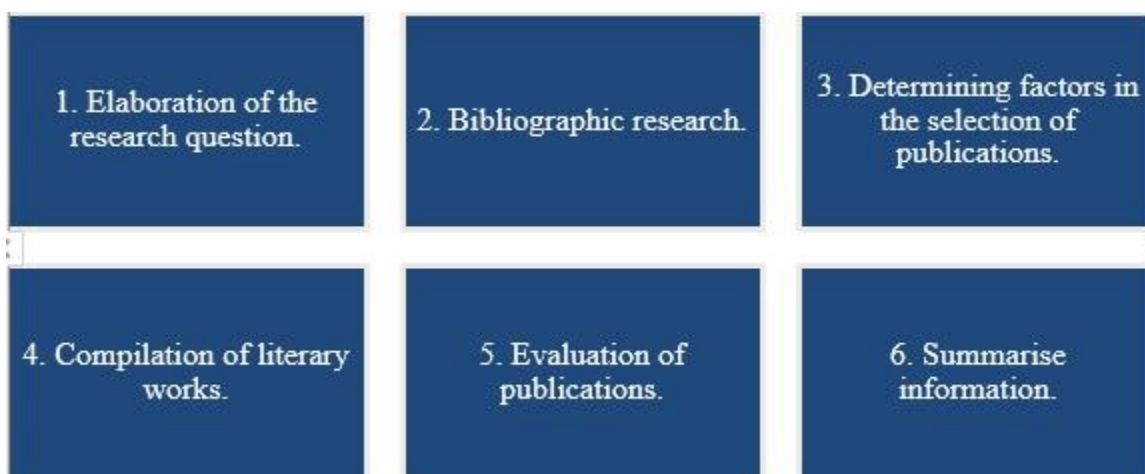
Figure 1. Stages of a Systematic Literature Review.

Considering a methodology to carry out research on the evolution of the Education Reform is relevant as it allows us to enhance the validity and relevance of the results. Considering the present study, the first 6 steps proposed by Colín [7] related to the Systematic Literature Review will be carried out (See image 1).