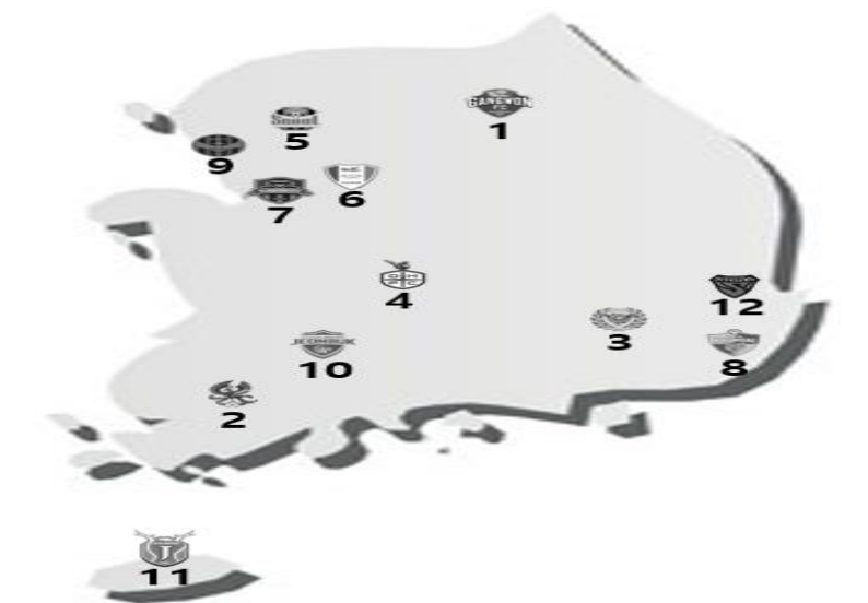
Figure 1. Venue of 12 teams in K League 1.

Edelweiss Applied Science and Technology ISSN: 2576-8484 Vol. 9, No. 2: 2366-2374, 2025 DOI: 10.55214/25768484.v9i2.5089 © 2025 by the authors; licensee Learning Gate