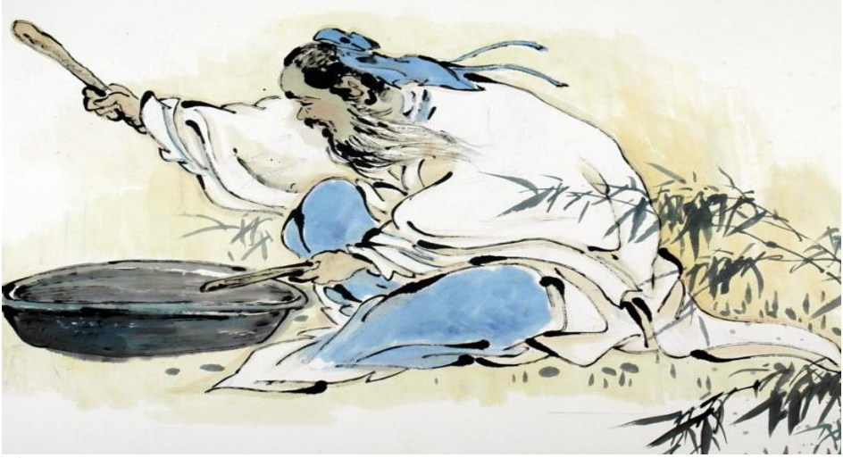
Figure 1. The Story of Zhuang Zixiu Becomes an Immortal by Beating the Basin is taken from Stories to Caution the World, one of the Three Words compiled by Feng [3] in the Ming Dynasty.

play has gone through many adaptations in the field of Chinese opera and drama. In the process of creation, the author found that the theme of the play was somewhat controversial. When the theme is "women's liberation", there are often cases of vilification of Zhuangzi and distortion of history; and the meaning and value of the theme of "women's unchastity" in contemporary times also needs to be reexamined. In addition, many dramas and film productions also suffer from the problem of fabrication and lack of historical basis. Based on the above background, the author proposes research questions and research objectives for the artistic creation and communication of Chinese historical dramas.