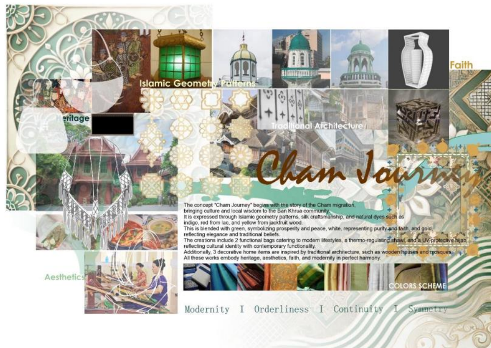
Figure 2. Design Concept & Mood board: "Cham Journey".

The researcher presented the design concept (Design Concept & Mood board) and designed 5 collections and re-evaluated the work from experts, communities and tourist groups (Focus Group) to select only 1 collection to be a prototype.