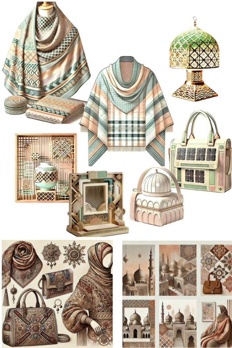
Figure 3. Shows the design work of 5 collections to be evaluated and selected again by 3 experts