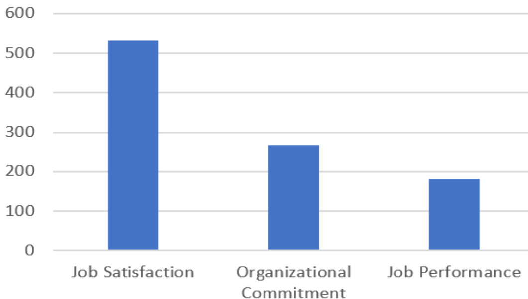
Figure 3. Most studied variables.

In Figure 2, the institutions with the highest number of affiliations are Brock University, which has 13 affiliations; the University of Utara Malaysia, with 12; and Saints Malaysia University, with 11 affiliations. It is important to note that Brock University is located in Canada, which is the place that groups the author with the highest number of publications related to the study variables.