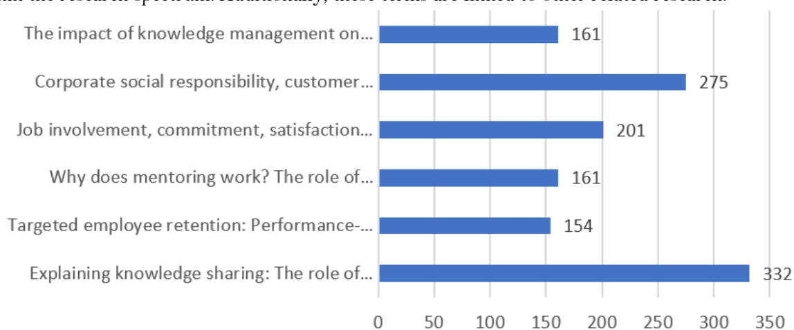
Figure 4. Publications with the greatest impact.

In Figure 3, it can be observed that of the 874 documents in the bibliometric review, the variable "job satisfaction" is the most frequently used term in various publications and is associated with our research. Meanwhile, the term "organizational commitment" has 268 occurrences within the review, and finally, the term "job performance" has 180 occurrences. This reflects the significance of these variables within the research spectrum. Additionally, these terms are linked to other related research.