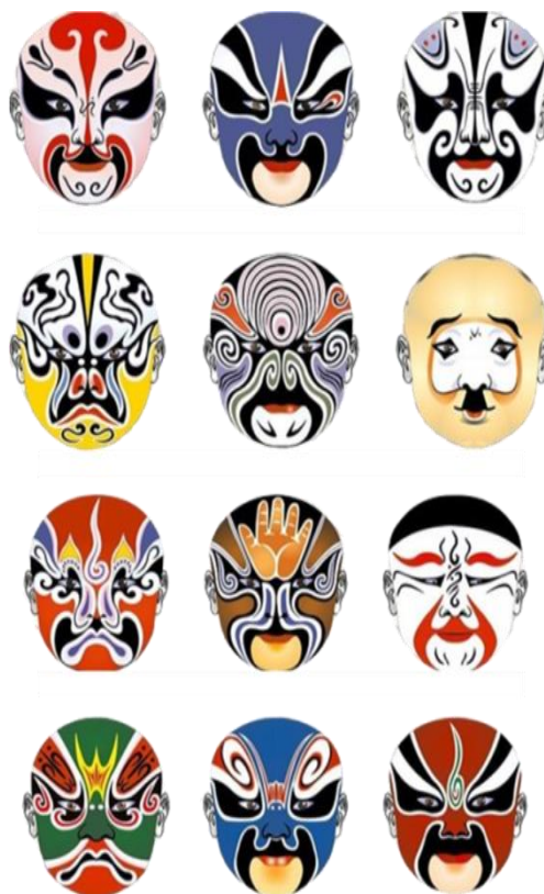
Figure 2. Opera masks.

The other is compound color, which emphasizes certain aesthetic qualities, such as a dignified elegance of red and yellow, by employing one hue as the primary color and another as an accent, infiltrate, or minor decoration. The mask has some concentrated color that is compound, displaying exquisite beauty. Mask colors vary in aesthetic qualities, including martial, serious, dignified, energetic, joyful, and magnificent. These characteristics also evoke distinct sentiments in people's minds.