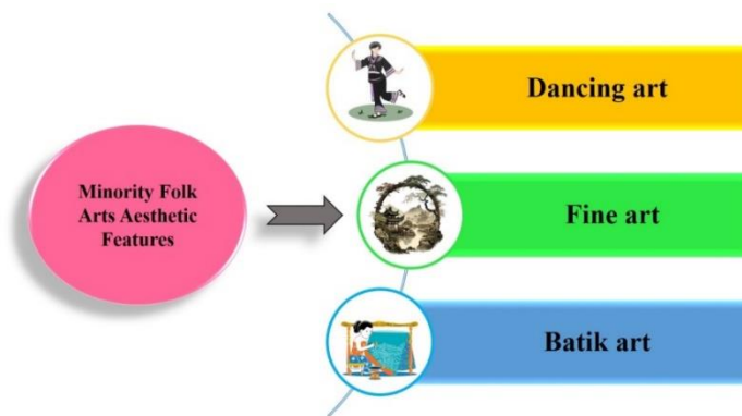
Figure 1. Guizhou minority folk art.

The distinctive artistic qualities of Guizhou minority folk art, including fine art, dance art, and batik art notably, are highly praised. Figure 1 illustrates the Guizhou Minority Folk Arts.